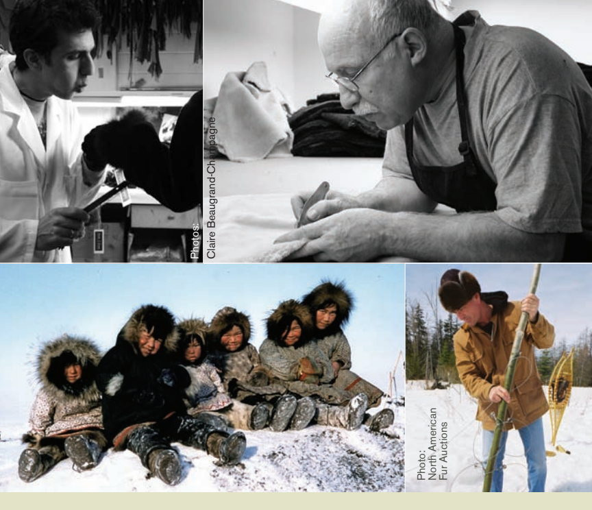
65,000 Canadians work in various sectors of the fur trade. The trade contributes $800 million to the Canadian economy, including more than $450 million in exports.

Fur farming helps to maintain rural communities, at a time when efficient modern agriculture is reducing farming populations in many regions.